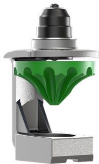
R65i VT Plate/ Body Assy 13771-002